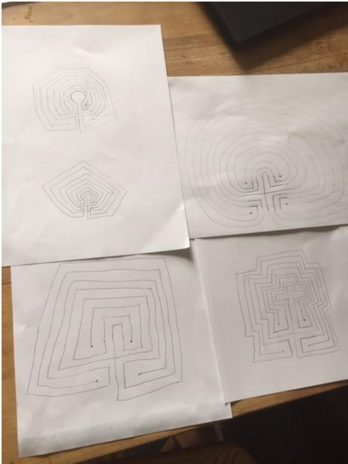
Derek Scofield 1

Once started I just became addicted and tried different shapes.