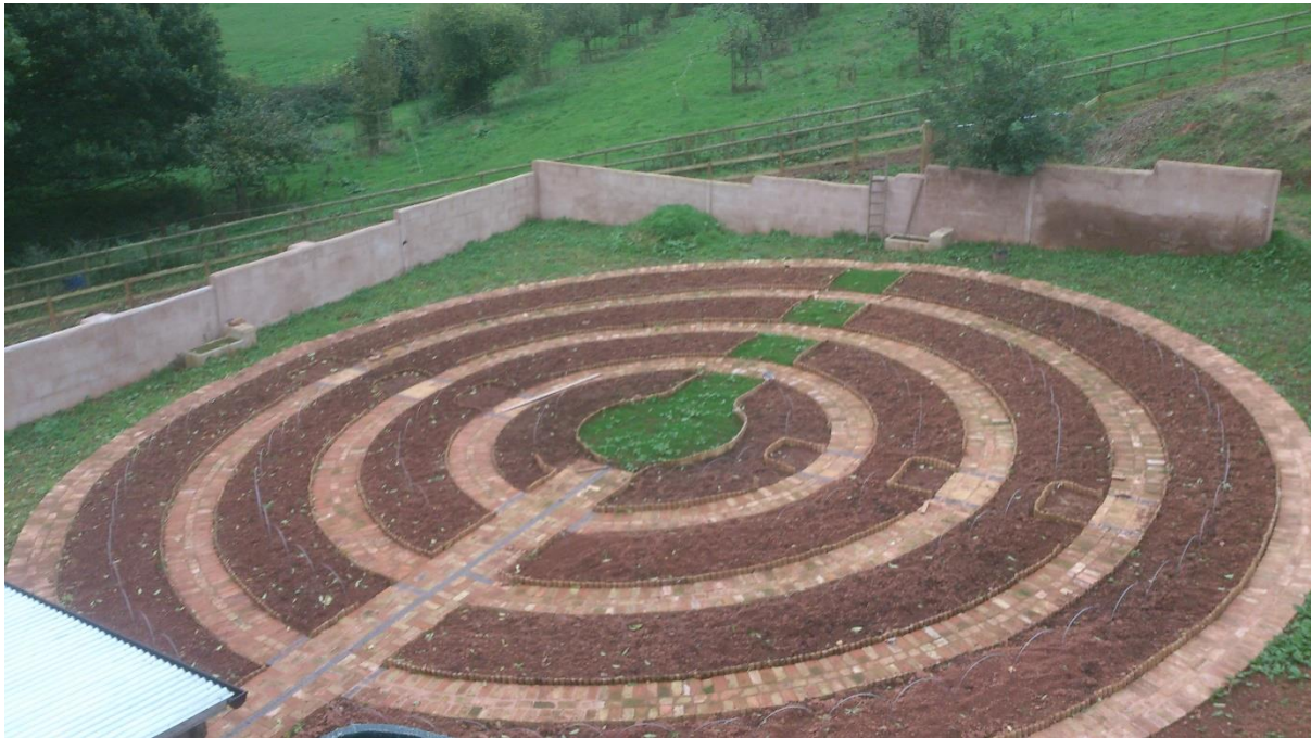
Noel Squibb 1

For full details of Noels Labyrinth, https://www.devondowers.org.uk/wp-content/uploads/2020/06/Noels-Labyrinth-Report.pdf